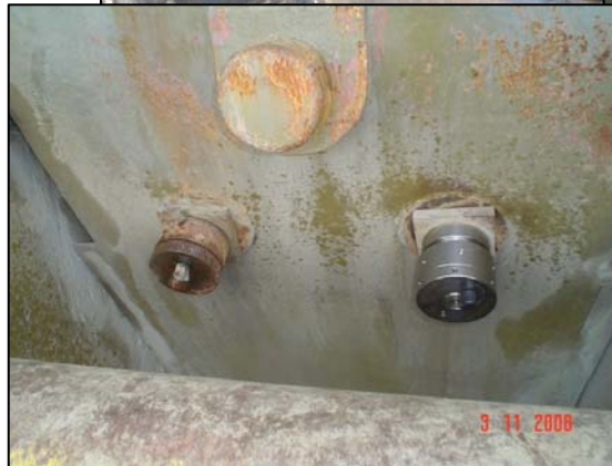
Front Jaw retained by HydraNuts