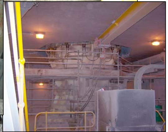
Multiple tensioning of HydraSures ensures an even load around the face