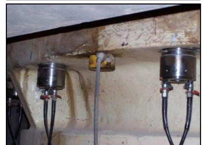
Sample of HydraNut application