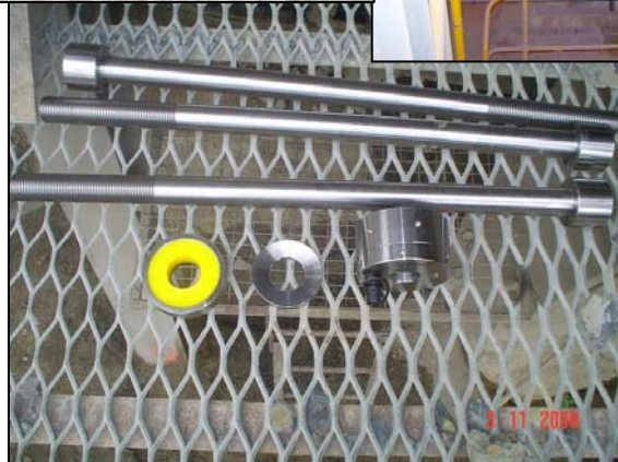
Technofast package including PolyWasher and special bolts

Technofast Industries 667 Boundary Road, Richlands 4077 Brisbane Australia