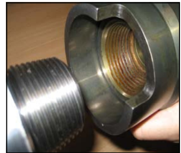
Multi start thread allows for speedy connection.