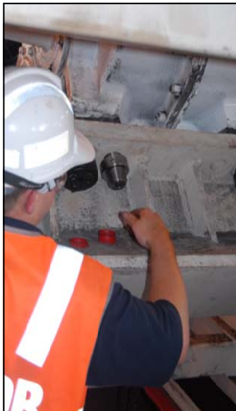
Mineral processing screen application.

technofast precision engineered solutions