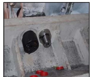
Mineral processing screen application.

For details of the other products available from Technofast, please visit our Website www.technofast.com